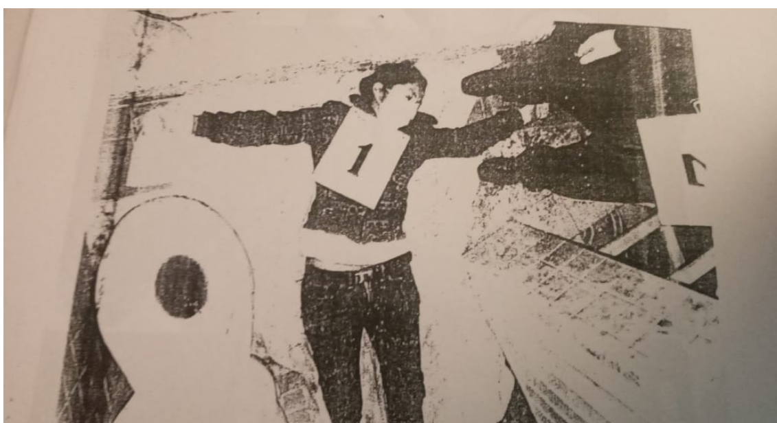
Reconstruction of the crime scene from the expediente.